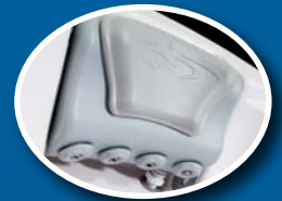
3 NeckFlex Pillows